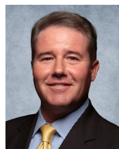
Bard Hoover Dallas Multifamily